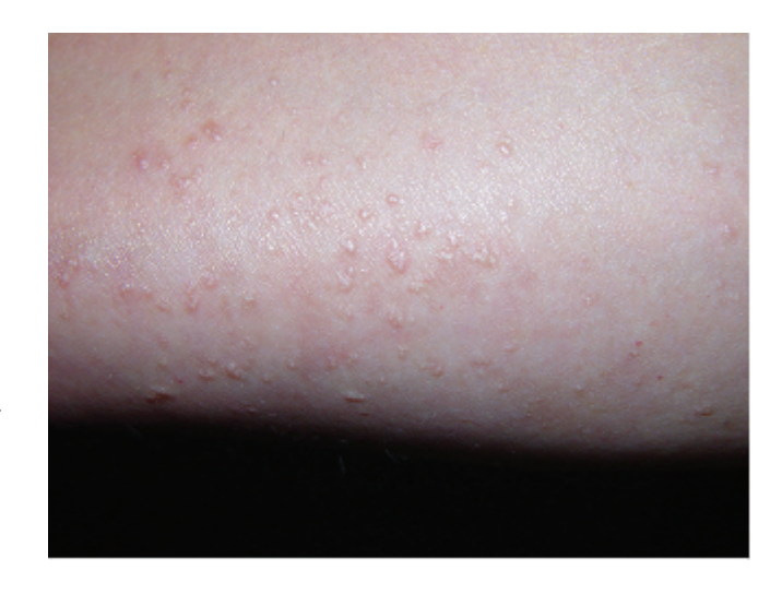
Figure 1. Case 1, Numerous small white papules on the arm in areas of prior contact dermatitis. Many lesions are grouped, linear, or both.

A 44-year-old Caucasian woman with a history of hypertension, rosacea, and granuloma annulare developed severe contact dermatitis on her arms from either poison ivy or Virginia creeper; she was treated with calamine lotion, oral antihistamines, and a 1-week prednisone taper. Three months later, she presented with numerous little white papules in the areas of the previous dermatitis (Fig 2). A biopsy specimen showed multiple cysts in the upper dermis, with thin stratified squamous epithelium